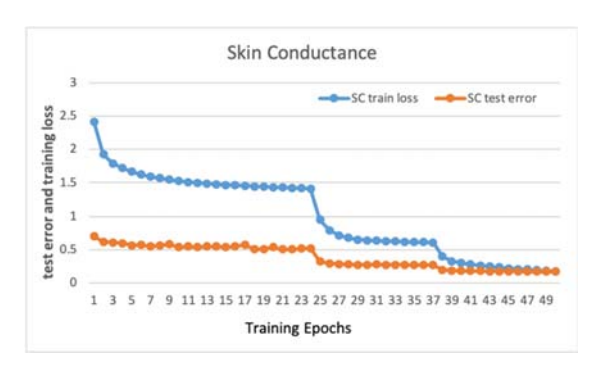
Figure 5: The test accuracy and training loss of DenseNet-101 on Skin Conductance.