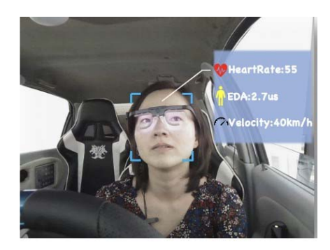
Figure 3: A Conceptual Map about Face-to-Multimodal system, which takes the left image as the input and presents the output as shown in the right image.

Also, in order to collect relevant driving status data, We have deployed and modified OpenDS [2, 10], a open-source cognitive driving simulator, for driving scenario generations and maintenance. Based on our built-in framework, we have confirmed that our modifications didn't affect the original functionality of the simulator, but provide better accuracy of data streams. Also, we utilise an alternative software to coordinate sensor data output for storage.