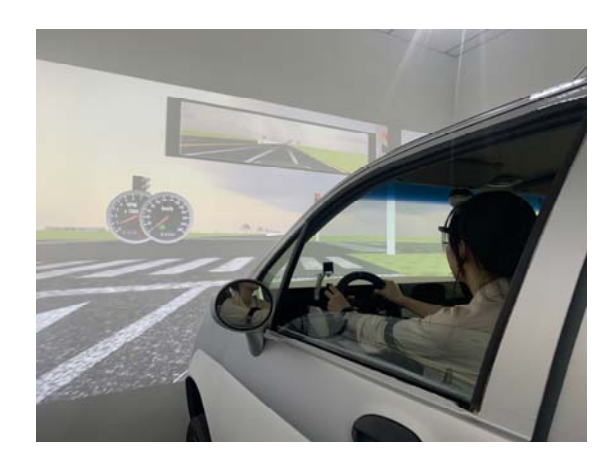
Figure 2: Another Example to Illustrate Data Collection Procedure.

In total, 27 recruited volunteers and they have filled an Internet questionnaire, to collect information about their driving life and their preference of driving styles. Then, we conducted a training course for every participant, by providing details about the process