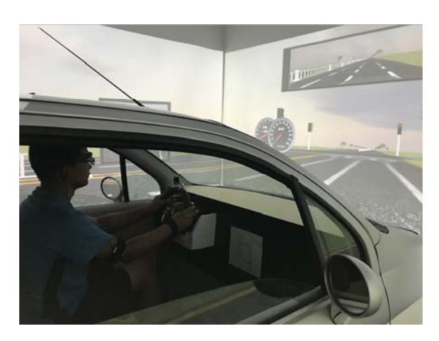
Figure 1: An Example to Illustrate Data Collection Procedure.

Speed respectively. These results suggest the promising future of speculative designs for multi-modal data retrieval through our approach, and we discuss the future challenges to encourage more variants to be built in the context of Human-Vehicle Interaction.