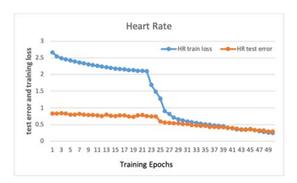
Figure 4: The test accuracy and training loss of DenseNet-101 on Heart Rate.

One of the most important characteristics, in the Face-to-Multimodal prototype, should provide instant reflections, in order to feed into more complicated Human-Vehicle Interaction systems, as their input sources. So we evaluate the latency of the overall system by presenting such a system towards all participants in the experiment.